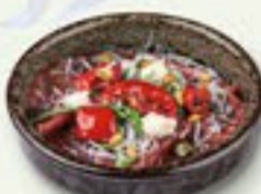
6 BIEFSALADE beef salad