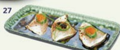
27 ZEEBAARS TATAKI flamed sea bass slice