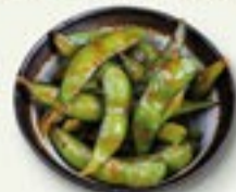
4 PITTIKE EDAMAME spicy soy beans