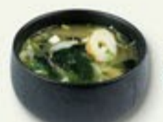
11 MISO SOEP soy beans soup