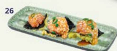
26 ZALM WASABI CRACKER minced salmon on wasabi cracker