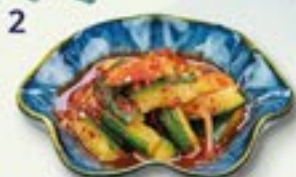
2 PITTIKE KOMKOMMER spicy cucumber