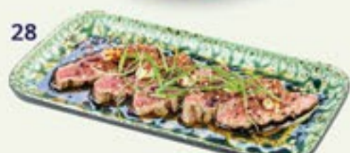
28 BIEF TATAKI flamed beef slice