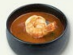
12 TOM YUM SOEP Tom Yum soup