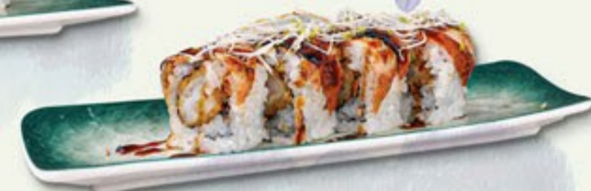
61 UNAGI & EBI ROLL eel & fried prawn + € 3,00