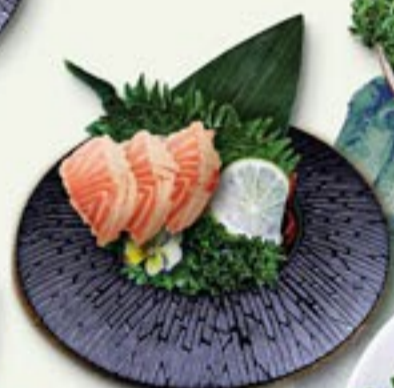
21 RAUWE ZALM 3 x raw salmon + € 2,50