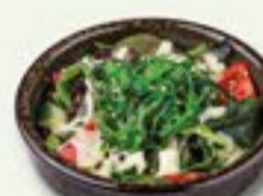
8 ZEEWIERSALADE seaweed salad