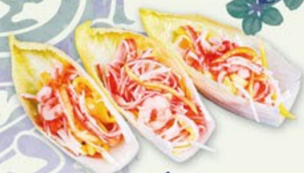
1 WITLOF & KRAB SALADE chicory and crab salad