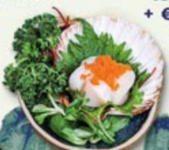
22 SINT-JAKOBSSCHELP scallop + € 2,50