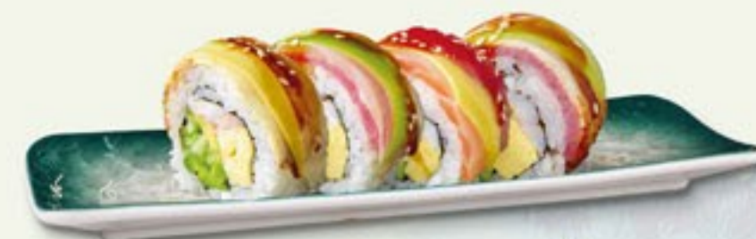
60 SURF & TURF ROLL flamed beef carpaccio & fried prawn + € 3,00