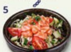
5 ZALMSALADE salmon salad