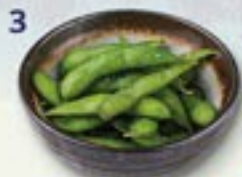
3 EDAMAME soy beans