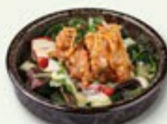
7 KIPSALADE chicken salad