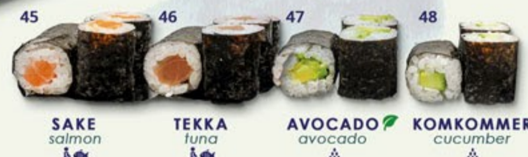
45 SAKE salmon